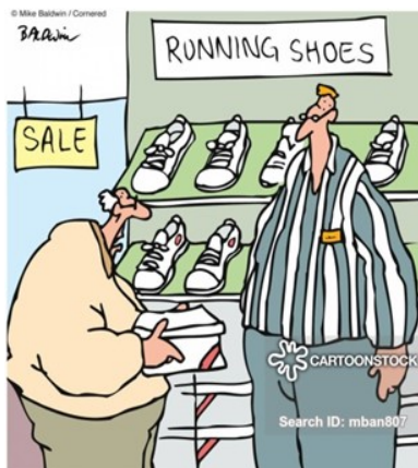
"I want a refund. They only shuffle."