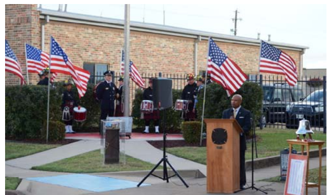
We Will Never Forget! Members of DeSoto Fire Rescue and EDUCT honor the citizen and first responder victims of 9-11.