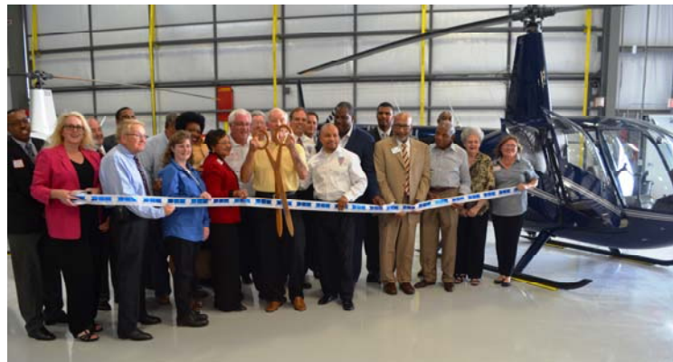
Senator Royce West joins members of the DeSoto City Council, DeSoto Economic Development Corporation Board, DeSoto Chamber of Commerce and fixed base operator, SKY Helicopters as they cut the ribbon on the new DeSoto Heliport located in DeSoto's Eagle Industrial Park.